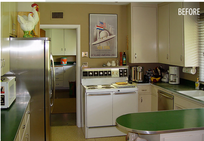
Before and After in Midtown