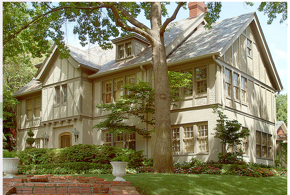
Historic home in Maple Ridge

We staff our jobs with an onsite project Project Manager who coordinates and optimizes all activities through the use of the Buildertrend construction management system. Cloud-based, it is an efficient way for clients to communicate with the team, archive documents and measure progress. To find out more about the Buildertrend program, view an introductory video on our website.