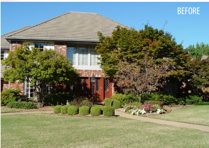
Before and After in South Tulsa

The combination of detailed drawings and specifications provide our clients with a package of information that is more comprehensive than any other firm in the Tulsa market. As a result, the scope of work for your project is clearly defined before the job starts.