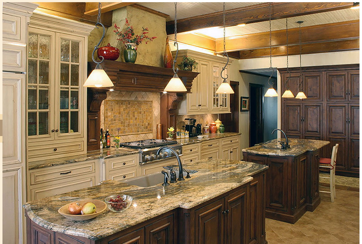
Stunning in South Tulsa

We know quality control inside and out. Schedule a conversation to discuss the role quality control must play in your home remodel.