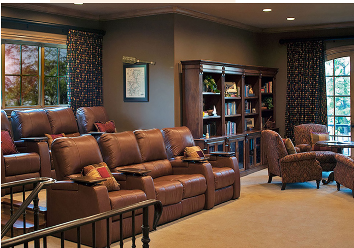
An inviting multimedia space in South Tulsa

When you choose the Buckingham Group, our focus will be on transforming your home to meet the wants and needs of your family. Our aim is to make your home renovation a pleasant, efficient and rewarding experience.